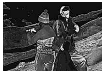
39. Thermal Narrative II