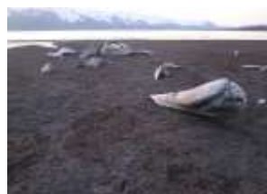
21. Legacy III - Lives Lost