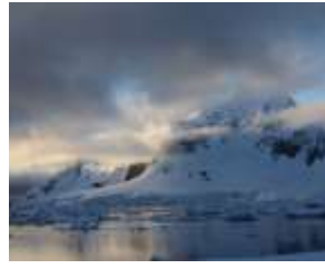
5. Dusks final light II