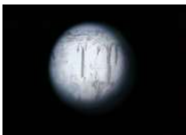
41. L.I.P. (version I) - II