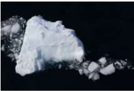
31. Inky Depths - The Final Melt II