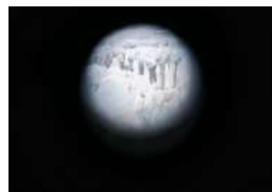
42. L.I.P. version I - III