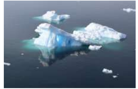
26. Glacial Melt IV