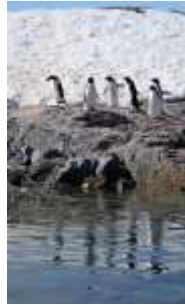
9. The Usual Suspects