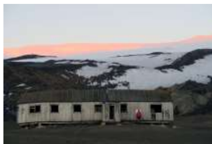
35. Legacy IV - Sunset Dereliction