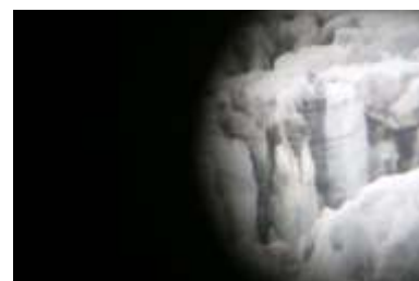
50. L.I.P. IX