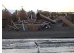
20. Legacy II - Living Carnage