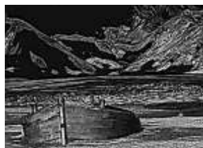
17. Legacy V: Whaling