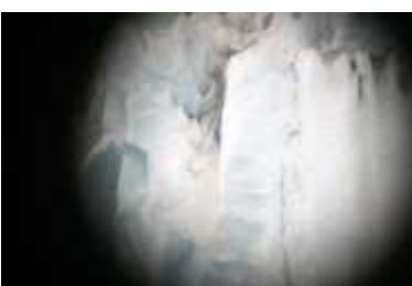
52. L.I.P. XI