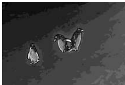
38. Thermal Penguins II