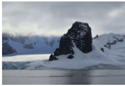
32. Antarctica - exposed I