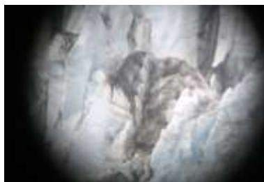
45. L.I.P. - IV