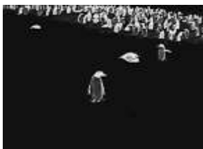
16. Thermal Penguins I