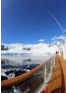
27. Walking the planks