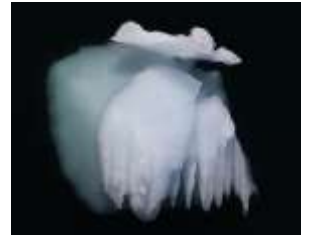
6. Inky Depths - The Final Melt I