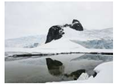
33. Penguins Paradise I