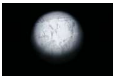
43 L.I.P. version I - IV