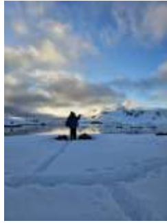
28. Footprint IV