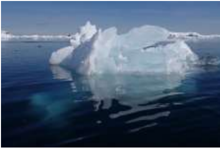
24. Glacial Melt II

IMAGE SIZE: 19 x 28 cm FRAMED PRICE: $300 UNFRAMED: $120