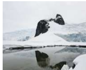
14. Penguins Paradise