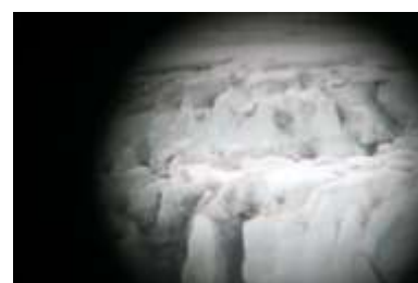
53. L.I.P. XII