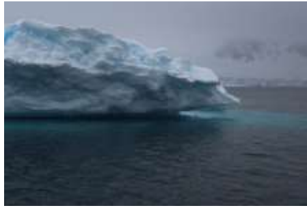
25. Glacial Melt III