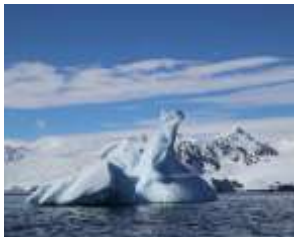
12. Top View