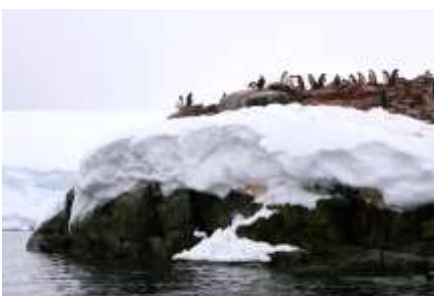
37. Gentoo + One