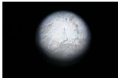
44 L.I.P. version I - V