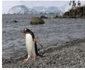
4. Avoiding the crowds