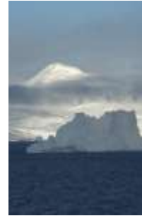
10. Into the light I