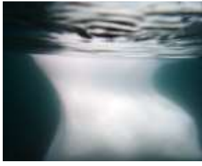
3. Glacial Melt

IMAGE SIZE: 40 x 30 cm PRICE FRAMED: $850 UNFRAMED: $550