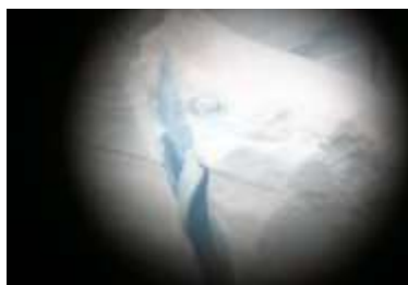
46. L.I.P - V