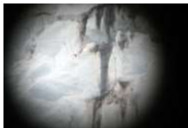
48. L.I.P. VII