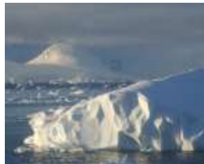
13. Evening Light I