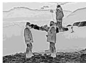
18. Thermal Narrative I