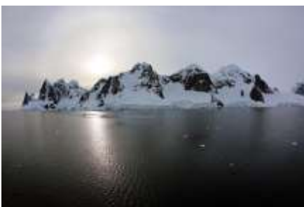
34. Forever Twilight I