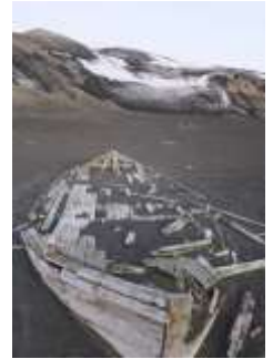
30. Legacy I