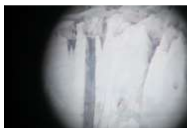
51. L.I.P. X