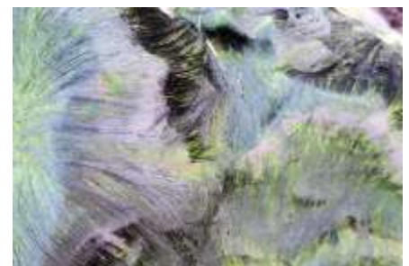
36. Rock 'n' Hair