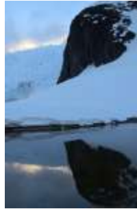
8. Dream Reflections