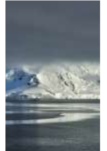
11. Evening Light II