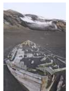
23. Legacy I