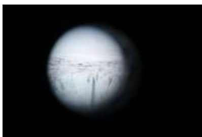
40. L.I.P. (version 1)- I

This series of photographs explores the question of the colonialist idea of exploration. These images, taken in 2017, of the glacier at Johnsons Dock, Livingston Island Antarctica depicts the glacier through the view of the single lens of a telescope. This instrument, a telescope, provided the vision of how early explorers saw the visual beauty of a new discovery before its commodification began.