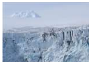
19. Livingston - Sky Island