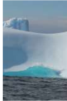
29. Glacial Wash