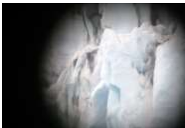
49. L.I.P. VIII