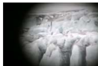
47. L.I.P. VI