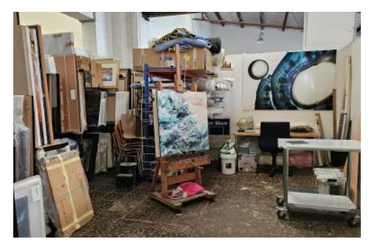
And I still have space to work... Yay!