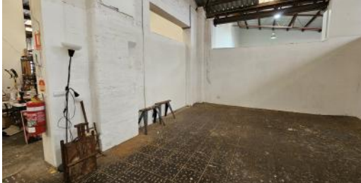
From this empty space to ....