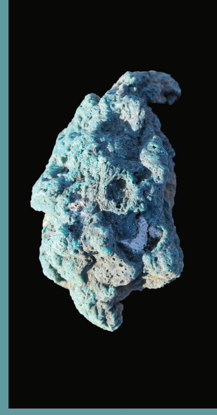
Unhappy Feet I and II, 2018

Floating in space resembling the colour of the icy waters of the arctic regions, a remnant of a penguin the legacy of our plastic world.